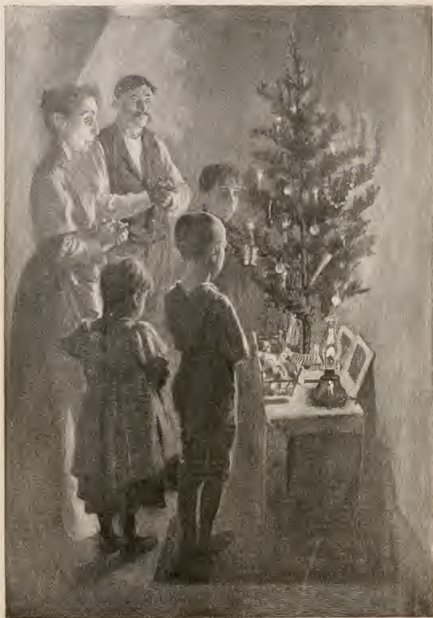
Merry Christmas in the Tenements.